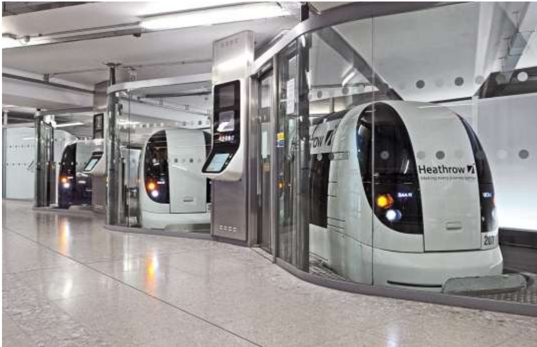
PRT station at Heathrow T5