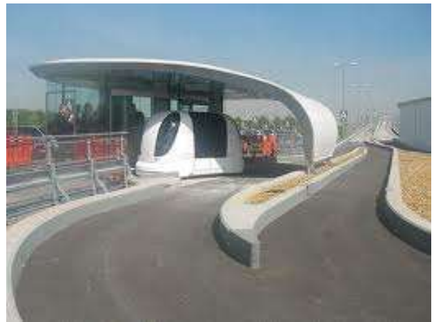
Vehicles can easily bypass any stations where a stop is not required. These 'offline stations' allow nonstop service from origin to destination, without intermediate stops.