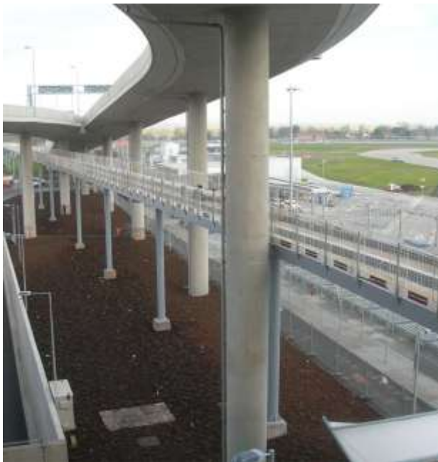
Compare lightweight PRT guideway (top-left to bottom-right) with large elevated roadway (top)